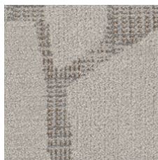
Listen 05100 LRV 31