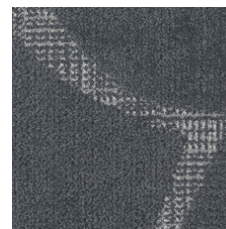
Express 05580 LRV 8.7