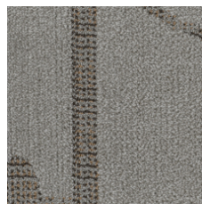
Story 05111 LRV 16.3