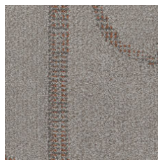
Connection 05105 LRV 24